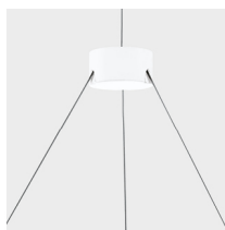
Connection for suspension 1 steel cable