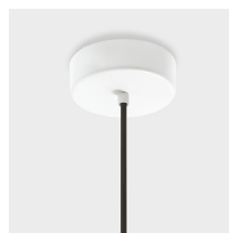
Ceiling rose suspension 3-4 steel cables