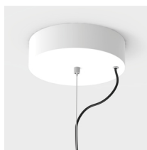
Ceiling rose suspension 1 steel cable Atollo 150