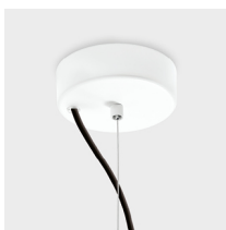
Ceiling rose detail