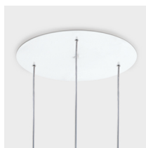
Ceiling rose detail for 3 elements composition