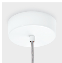
Ceiling rose detail