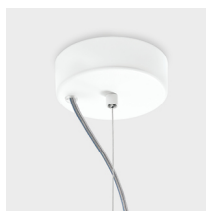
Ceiling rose detail