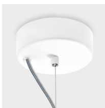
Ceiling rose detail