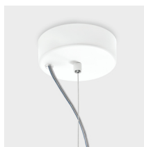
Ceiling rose detail