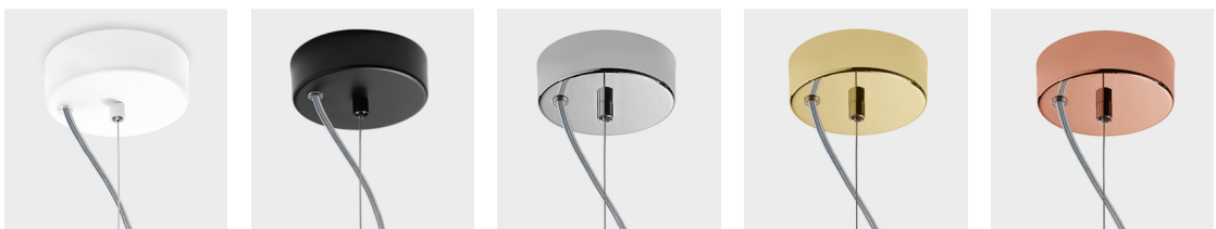
Ceiling rose detail