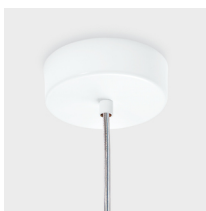
Ceiling rose detail