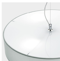
Detail of upper plexiglass protection