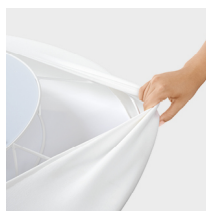
Lycra removable and washable at 30° class M1