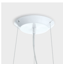
Ceiling rose detail